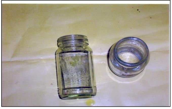
Figure-1. Pit fall Trap Method